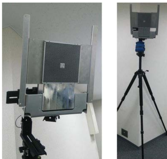
Fig.3. Photographs of the 60 GHz GATE

In addition, using a future architecture technology called content centric networking (CCN) *6 , KDDI Labs developed a method that operates together with the mmWave small zone (60 GHz band) and large zone long-term evolution (LTE) schemes in HetNets [3]. We could therefore realize high-speed file transfer in the mmWave band without the user being aware of switching of bands when passing through the GATE system.