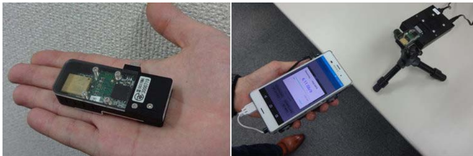
Fig.2. Photographs of a 60 GHz 6.1 Gbps wireless module (left) and of experimental setup for wireless transfer of files to a smartphone (right)

conversion radio-frequency (RF) LSI and analog circuit with 40 nm CMOS process that includes a 2.3 G Sample/s 7-bit analog-to-digital converter (developed by Matsuzawa and Okada Labs at Tokyo Tech), and a 40 nm CMOS baseband (BB) LSI that incorporates a media-access control (MAC) layer and PHY layer that uses the above analog circuit and rate-compatible low-density parity-check (LDPC) codes *4 with code rates of 14/15 and 11/15 (developed by Sony). The design of this 60 GHz wireless module is based on the first draft of the IEEE802.15.3e *5 standard. They also developed a file transfer system with a high cache memory capacity that can be accessed directly from the wireless module with very high throughput. A 60 GHz wireless transfer system using the developed wireless module and file transfer system demonstrated the world's fastest user data rate of 6.1 Gbps (which can transfer a 1 GB file in 1.3 s). The system enables users to receive large quantities of data in moments, without the low data throughput limitations of current commercial mobile devices.